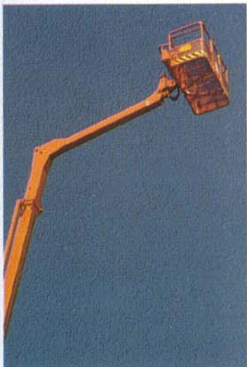
13 ft. (4m) Extend-A-Reach feature increases operator versatility in positioning the work platform.

A high performance telescopic boom lift with extendable axle, JLG's patented Extend-A-Reach, 4-wheel drive and crab steer all as standard equipment. Purpose designed for a wide variety of demanding maintenance, construction and high reach access applications.